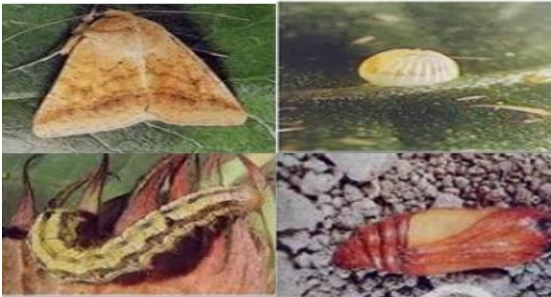
1-rasm. G'o'behind the tunnels

The volume and accuracy of the initial data reveals the importance of the entire information system. At the same time, obtaining initial information is the most difficult and labor-intensive part of the information system. This is achieved through the results of the ecological, physiological, ethiological, economic and mathematical-statistical foundations of methods of obtaining preliminary data, methods of automation of their acquisition and processing. At the same time, it is necessary to ensure that only the information necessary for the solution of the issue is received within the specified time frame and volume.