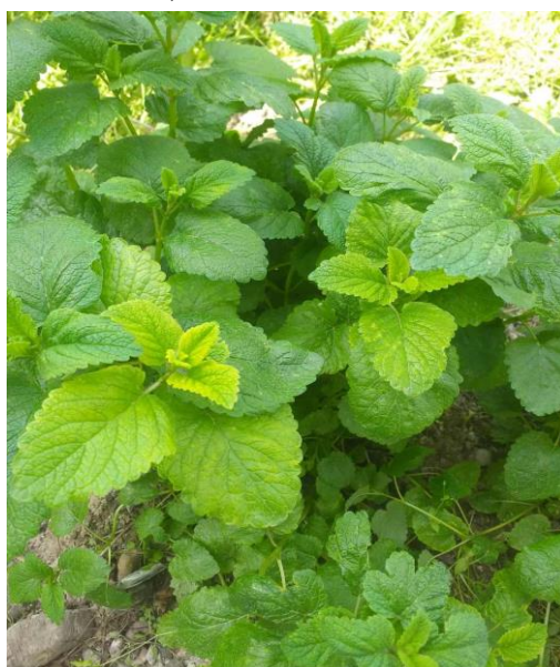
Figure 1 Asian mint, water mint

Mentha asatica Boriss is an Asian mint, a water mint.