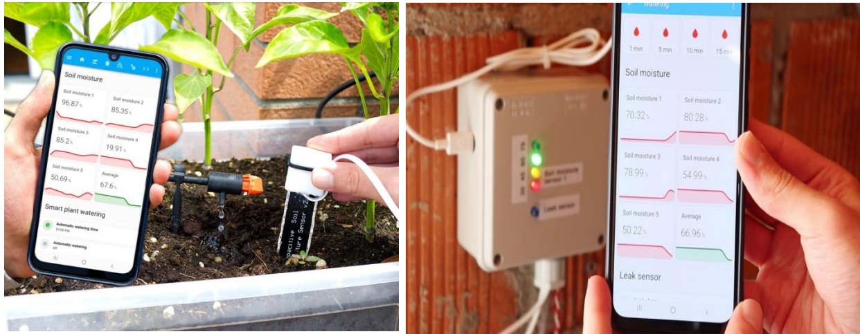
Figure 2 - Soil moisture readings over 3 day test period maintaining 40% set point

Figure 2 shows the soil moisture readings over time as the system maintained the set point. The moisture generally remained within a +/- 3% range of the 40% target. This demonstrates the ability of the system to control moisture precisely using the feedback from the FC-28-C sensor.